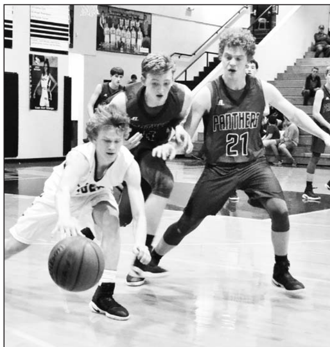
This questionable out-of-bounds play came right before halftime. After a Dawson player deflected the ball out, the officials ruled it out off of Union. Seconds later, the Tigers took advantage and scored a go-ahead basket for a one-point halftime lead. The Panthers would never lead again.